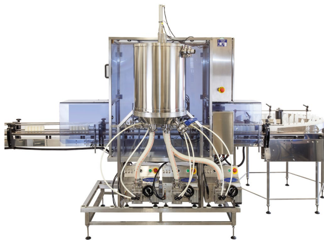
(Above) automation base with three Response units fitted, seen from the rear