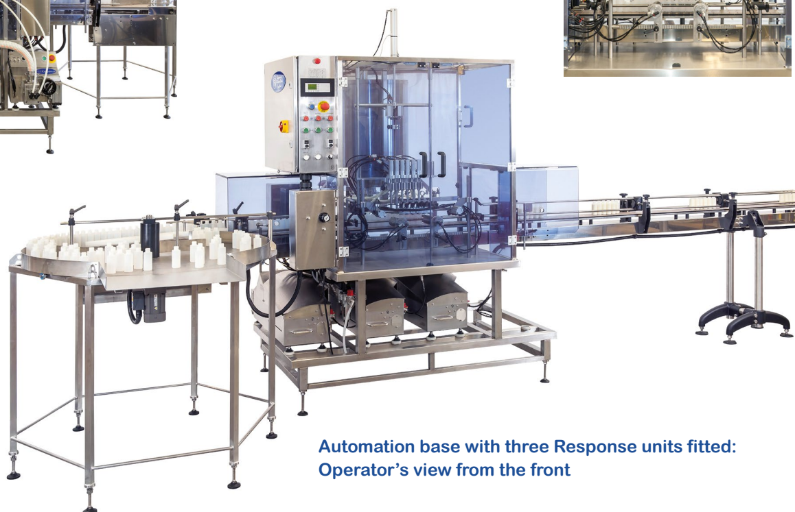
Automation base with three Response units fitted: Operator's view from the front