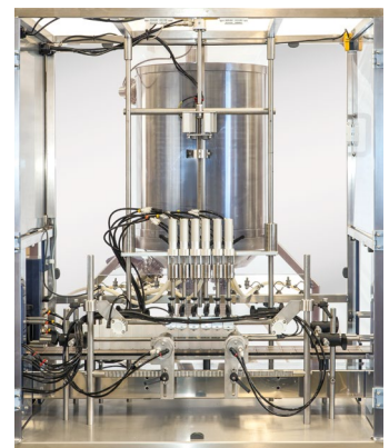
(Right) close-up of filling area