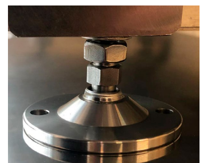
ATEX compliant feet