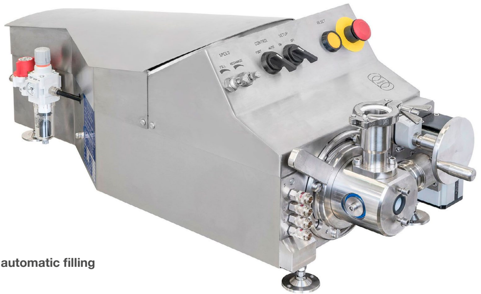
CAT II 2 G c T 5 (100 Degrees Celsius) automatic filling machine.

ATEX is the name commonly given to the European Directive for controlling explosive atmospheres. Our Response Filler can be adapted to comply with directive 94/9/EC (also known as 'ATEX 95' or 'the ATEX Equipment Directive') on the approximation of the laws of Member States concerning equipment and protective systems intended for use in potentially explosive atmospheres.