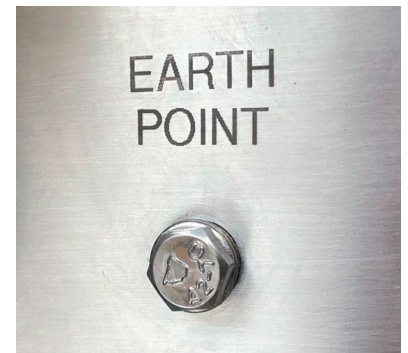
The Earth Point

Please note that our ATEX machines do not cover explosive risks from dust; only gas.