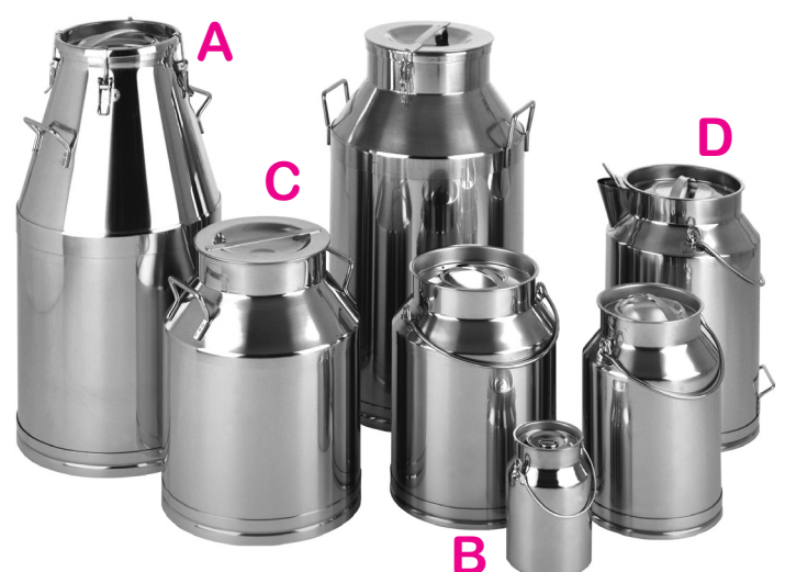
A Chemical churns B Churns with swing handles

Manufactured from grade stainless stee these churns are sp designed for the sto transportation of an and chemicals. The complete with side handles, skirtband (secured by toggle and a Viton® seal). They have crevice- and pit-free interiors and are polished throughout.