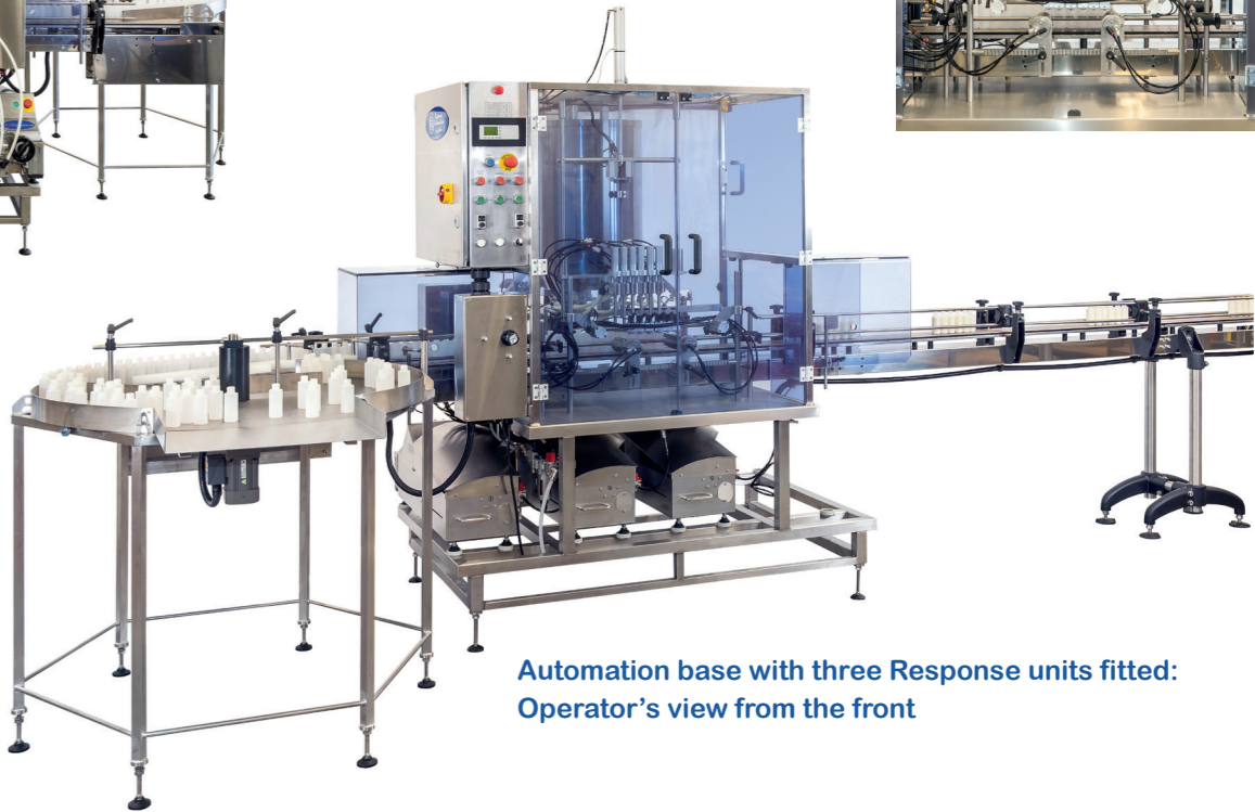
Automation base with three Response units fitted: Operator's view from the front