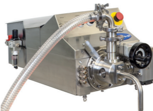
(Above) with standard hopper for filling creams, pastes, and solids in suspension