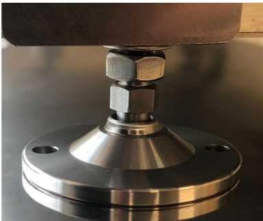
ATEX compliant feet