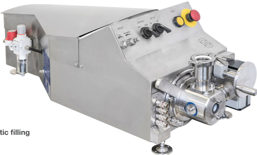
CAT II 2 G c T 5 (100 Degrees Celsius) automatic filling machine.

ATEX is the name commonly given to the European Directive for controlling explosive atmospheres. Our Response Filler can be adapted to comply with directive 94/9/EC (also known as ‘ATEX 95’ or ‘the ATEX Equipment Directive’) on the approximation of the laws of Members States concerning equipment and protective systems intended for use in potentially explosive atmospheres.