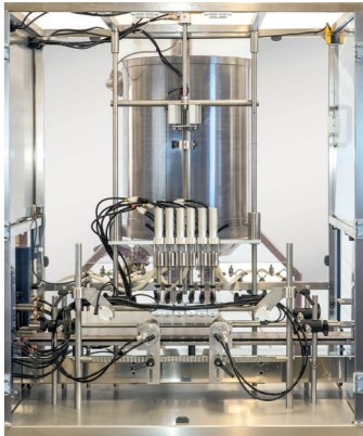
(Right) close-up of filling area