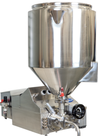
(Below left) heated hopper for hot fills.

These machines are ideally suited to those wanting to start automating a previously manual filling process, and those that don’t currently require the output levels offered by a fully automated solution. However, once production demands increase, Response units can be mounted onto an Automation Base to create an extremely flexible fully automatic filling machine.