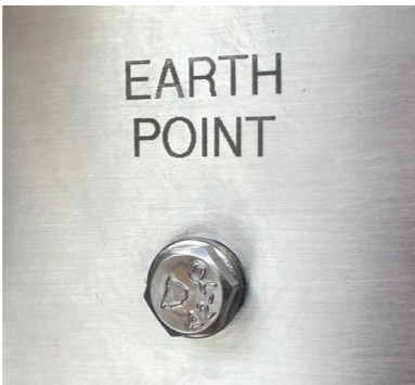
The Earth Point

Please note that our ATEX machines do not cover explosive risks from dust; only gas.