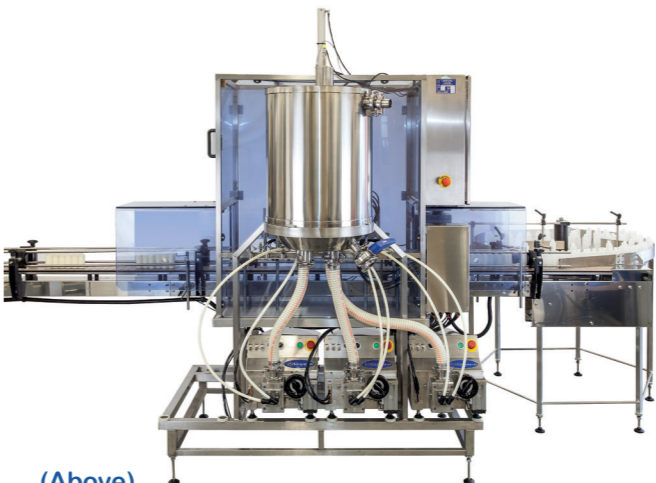
(Above) automation base with three Response units fitted, seen from the rear