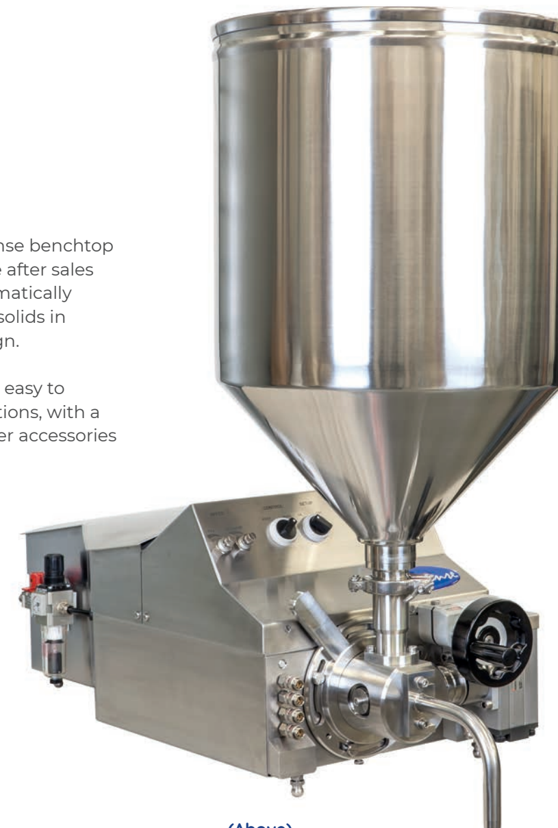
(Above) With standard hopper for filling creams, pastes, and solids in suspension