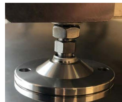
ATEX compliant feet