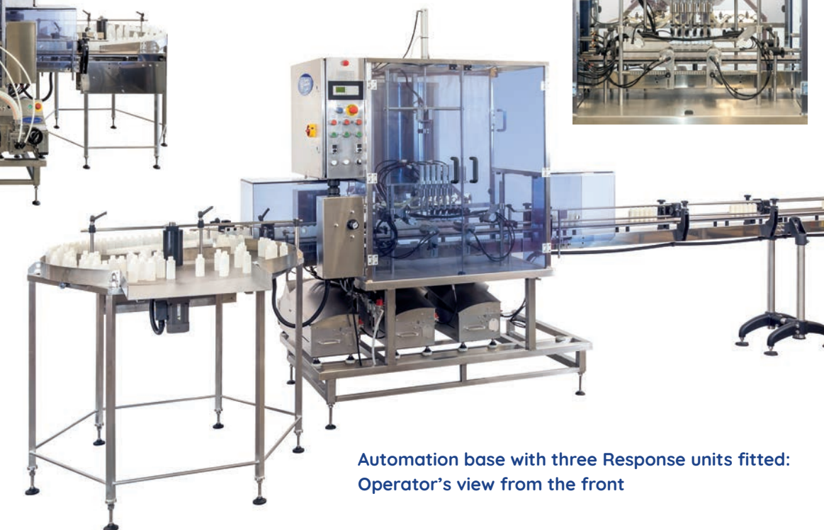
Automation base with three Response units fitted: Operator's view from the front