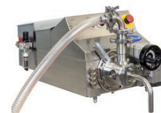
(Below) With pipe feed attached, for liquid fills.