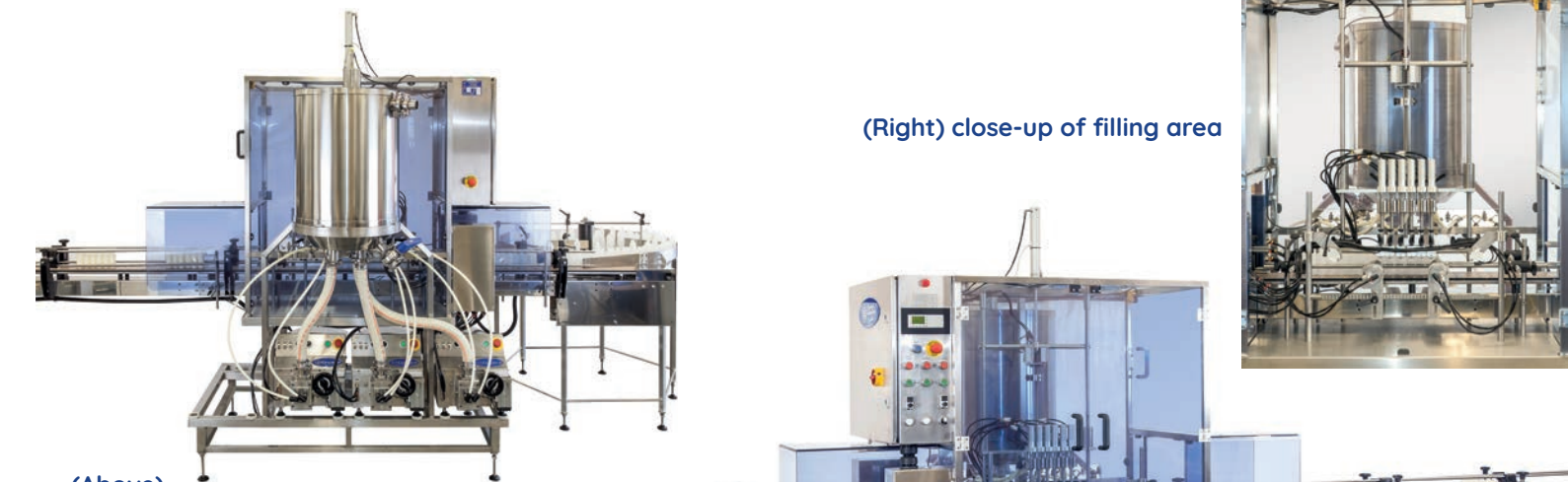
(Above) Automation System with three Response units fitted, seen from the rear