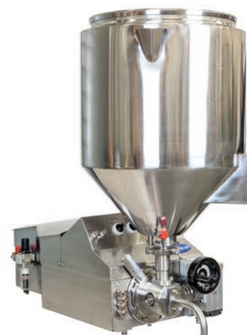
(Left) A heated hopper for hot fills.

These machines are ideally suited to those wanting to start automating a previously manual filling process, and those that don't currently require the output levels offered by a fully automated solution. However, once production demands increase, Response units can be mounted onto an Automation Base to create an extremely flexible fully automatic filling machine.