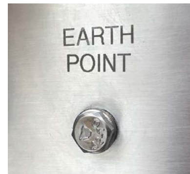
The Earth Point